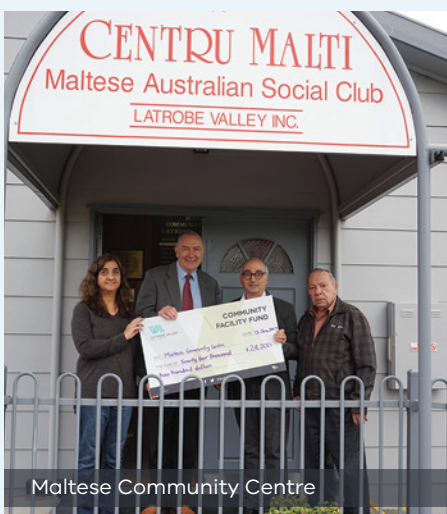
Maltese Community Centre