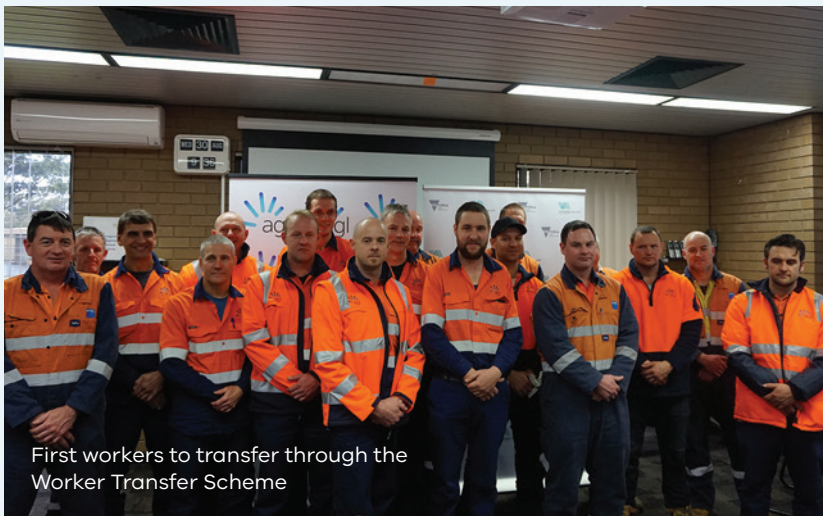
First workers to transfer through the Worker Transfer Scheme