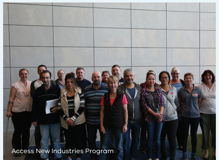
Access New Industries Program