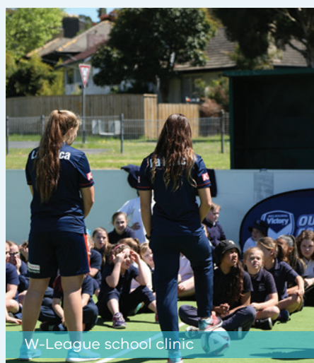
W-League school clinic