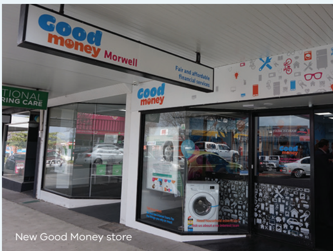
New Good Money store