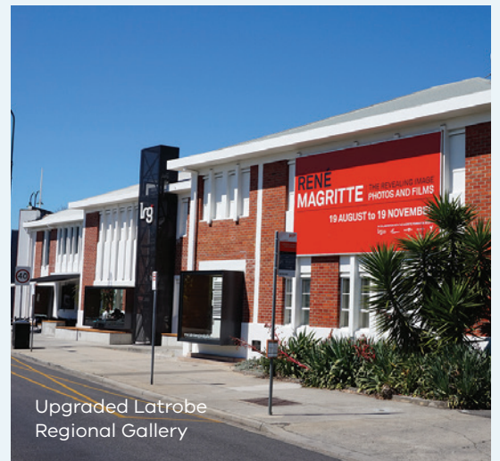
Upgraded Latrobe Regional Gallery